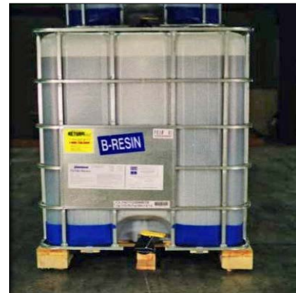
FIGURE 5—MIRACLE FOAMSEAL F-2100 RESIN NT BLUE TOTE