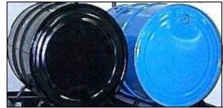
FIGURE 3—55 GALLON STEEL DRUMS