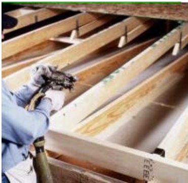
FIGURE 2—APPLICATION OF MIRACLE FOAMSEAL F-2100