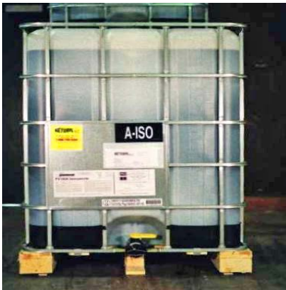
FIGURE 4—MIRACLE FOAMSEAL F-2100 ISO NT BLACK TOTE