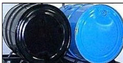
FIGURE 3—55 GALLON STEEL DRUMS