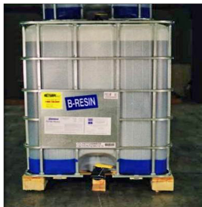
FIGURE 5—MIRACLE FOAMSEAL F-2100 RESIN NT BLUE TOTE