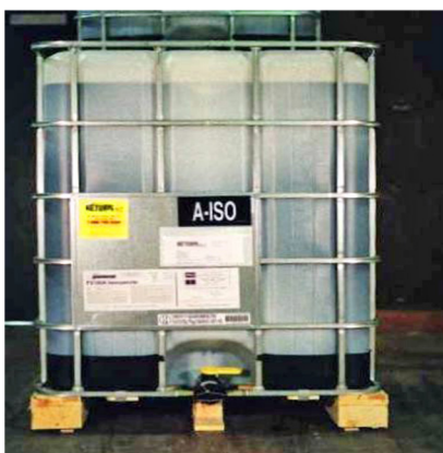
FIGURE 4—MIRACLE FOAMSEAL F-2100 ISO NT BLACK TOTE